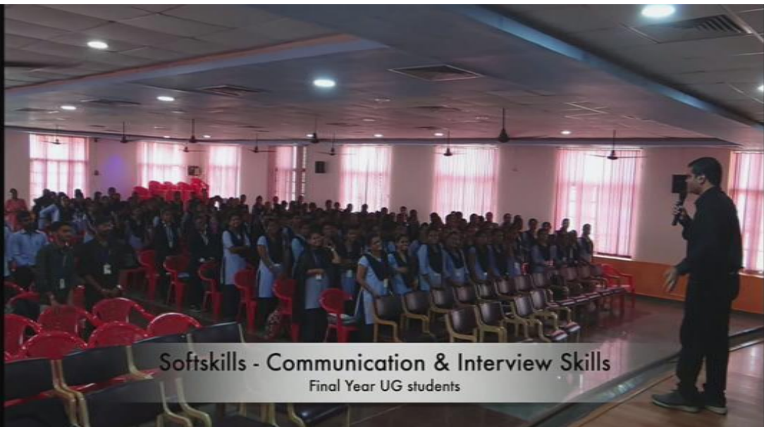
Softskills - Communication & Interview Skills Final Year UG students