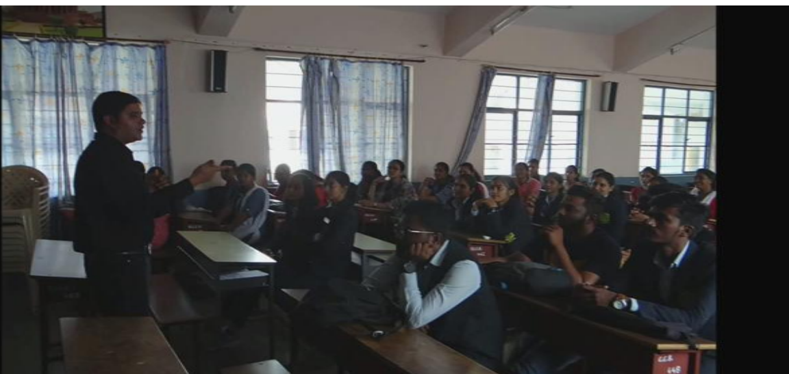
Softskills - Communication & Interview Skills Final Year UG students