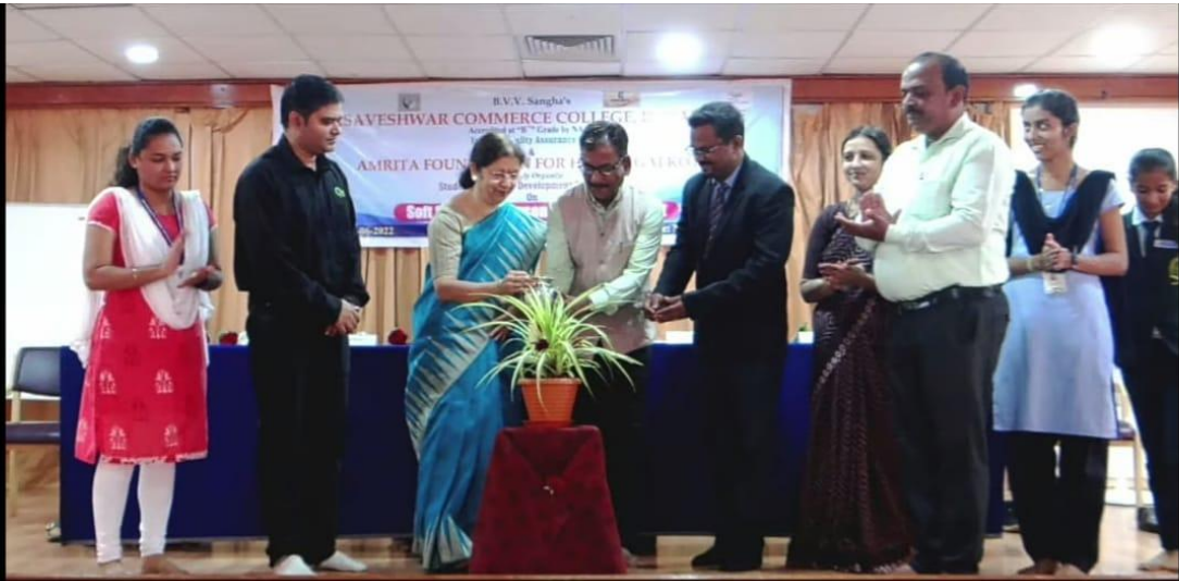
B V V Sangha's Basaveshwar Commerce College Bagalkote & Amrita Founda