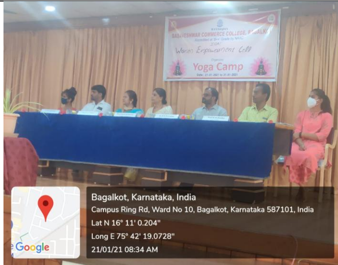
Photo Gallery of 6 days Yoga Camp