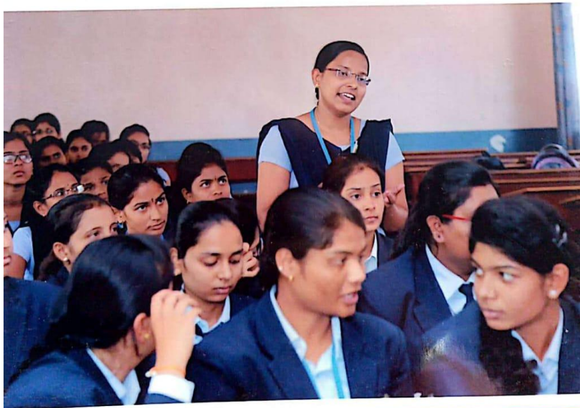
Interaction with the Students