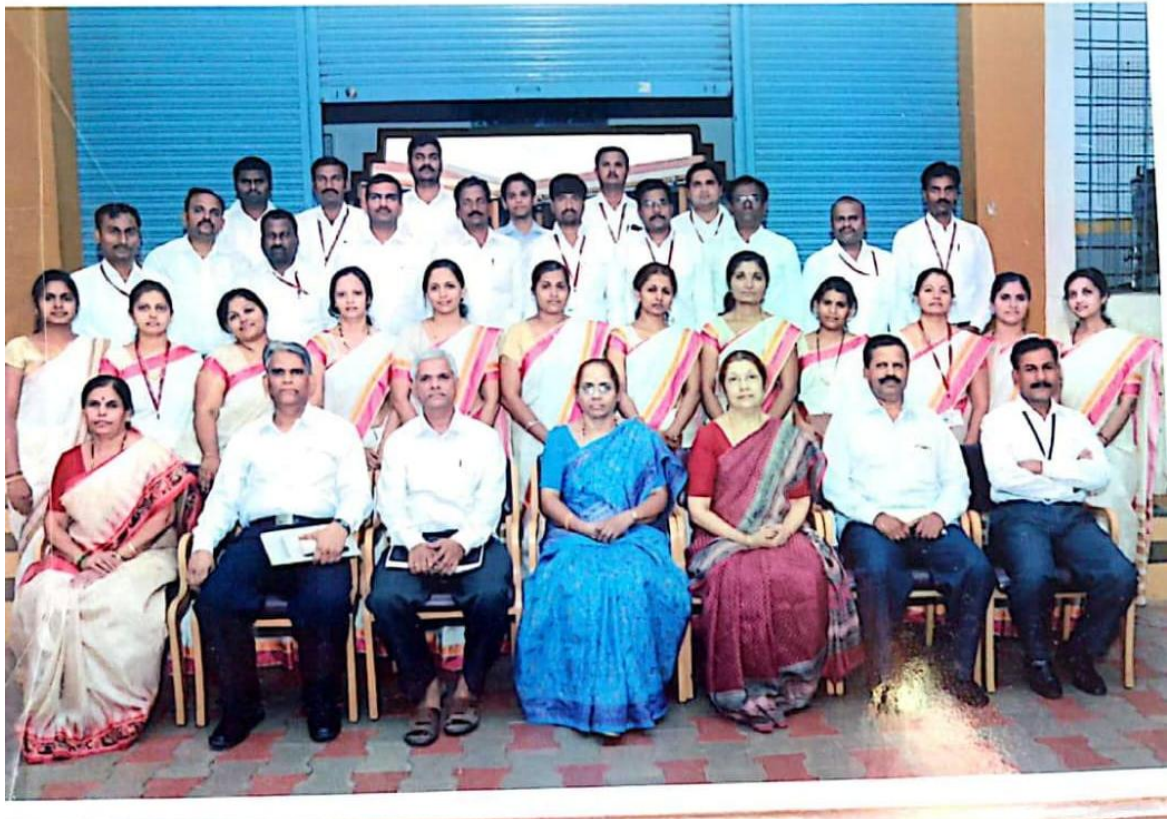
Staff of the College with the PEER Team of AAA on 02-04-2018