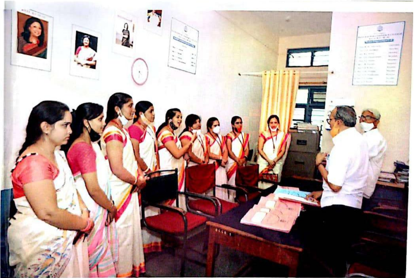
Visit to Library