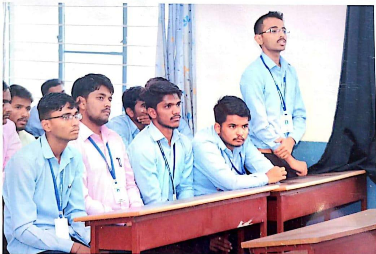
Interaction With The Students